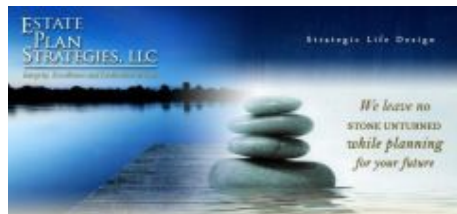
Estate Plan Strategies St. Louis, MO

Spewak and Estate Plan Strategies, LLC have developed a unique lifelong client relationship model to provide clients with peace of mind knowing what they work a